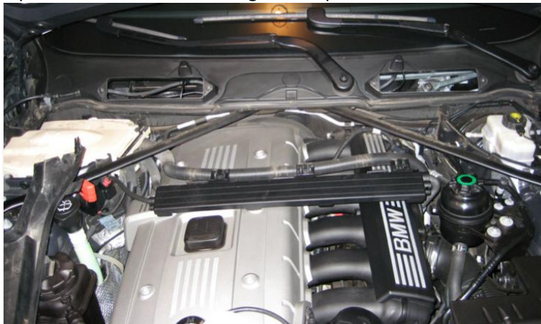
White DME cover on far left. All other covers removed.

By now you should have the white compartment behind the passenger strut tower completely exposed. This is where the engine computer is housed.